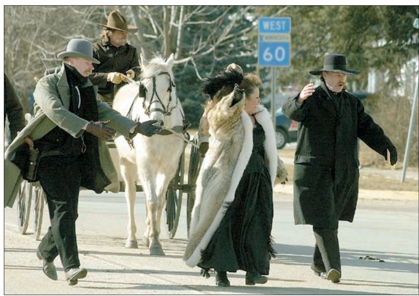
A group of Cannon Old West Society members head down the parade route.